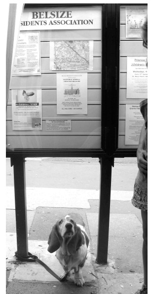
Waiting hopefully: a four-legged Belsize resident guards the noticeboard

BRA joined browsers on Saturday 27 September for the annual green fair run by Transition Belsize - a great communal event. Overheard at one stall: "I was a bit disappointed when I first arrived: I came along today expecting a fair in a park"!