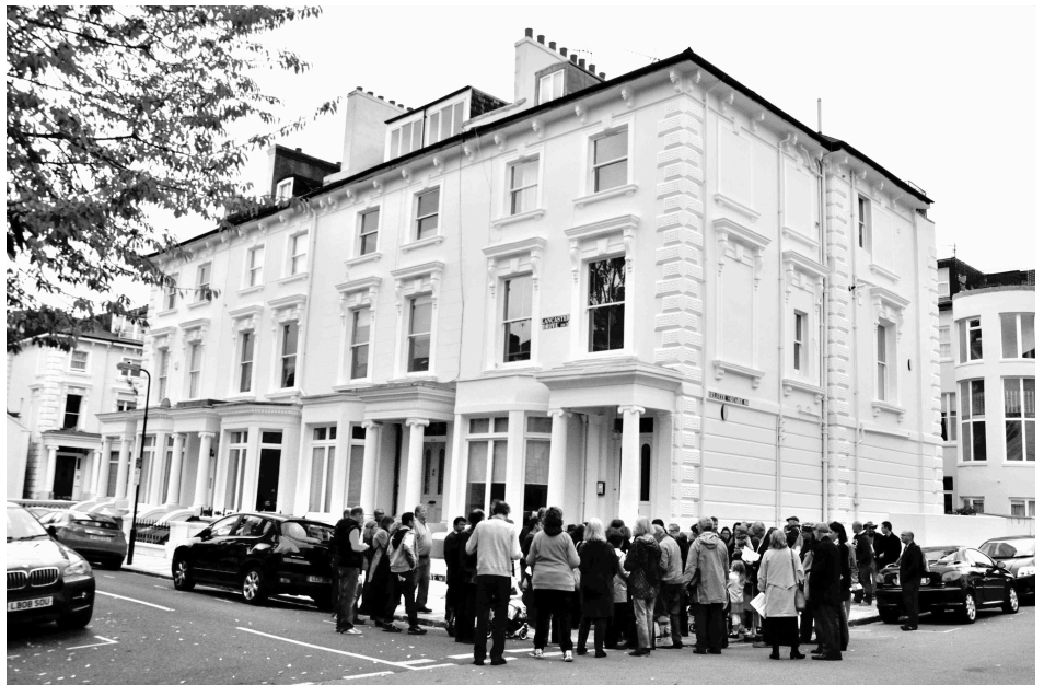
Belsize Square meets Lancaster Drive: elegant classical-style housing for the aspiring middle classes built by Daniel Tidey