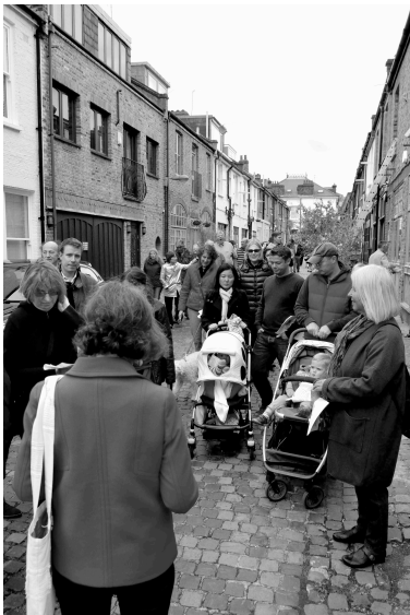
Eton Garages: a handy quiet cut-through for strollers, large and small

Despite the long and entertaining historical journey it took us on - through manor houses, country retreats, pleasure gardens and 19th century developers - the walk took us only an easy distance, leading along Belsize Park, round Belsize Square into Lambolle Road, then through Eton Garages to the point where Eton Avenue meets England's Lane, before heading back down Eton Avenue in time for tea and cakes. Our thanks are due to our hosts, Sarum Hall School, and - as ever - to the BRA tea-makers, cake bakers and serving team.