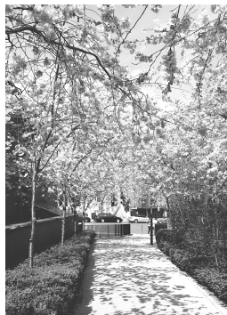
Spring at last: the sun came out, and so did the Swiss Cottage cherry blossom