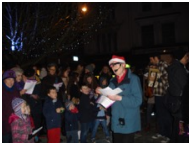
Thank you to all who attended and contributed to the event!