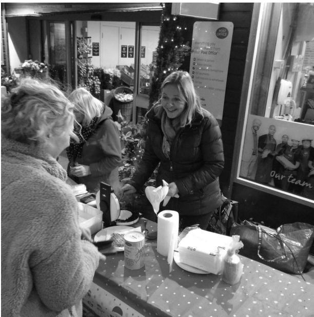
Outside Budgens, many gathered for a sing-a-long, homemade German waffles, brownies and cookies