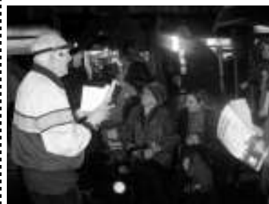
Damp but undaunted: last year's singers

We'll bring the song sheets, so just wrap up well and bring a torch. Mince pie and collection proceeds will go to the Marie Curie Hospice.