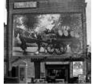
Lost in our lifetime: the Haverstock Arms mural, Upper Park Road, 2012

Rarely can an hour have been so rich with fascinating images and stories as during David Percy's illustrated talk, Belsize in View , at Belsize Community Library on 13 November. Shown on a large screen, a succession of rare engravings, paintings, photographs, many hand-coloured, appeared, transporting us - via David's enlightening commentary - through the streets and scenes of 'greater Belsize' from the 18th century to the 21st.