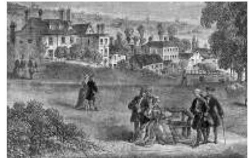
Pond Street, 1750