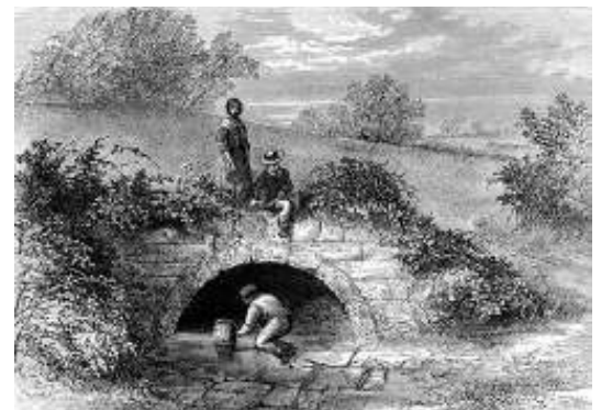
Shepherd's Well, 1820: a rustic scene, but hard work for water carriers

images we enjoyed (of which these are a tiny sample) were among those collected for his new film, The Belsize Story, volume 2 , available from Daunt Books Haverstock Hill, Primrose Hill Books, and www.belsizestory.com . And David will repeat the Belsize in View talk at Burgh House on 13 April 2014.