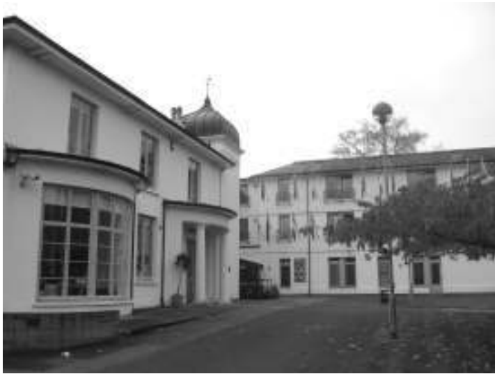
The Olave Centre: elegant headquarters of a worldwide movement