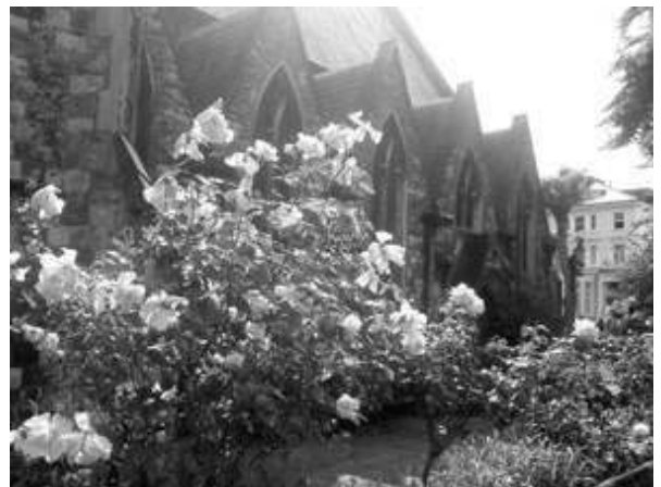
A haven for roses and local residents: St Peter's church garden

The two local good causes we will be supporting this year are Belsize Community Library and St Peter's church garden. The Library have chosen to put our donation towards buying new computers that the public can use. St Peter's will be using their share to improve the open space around the church, which is widely used as a quiet little outdoor space to stroll and sit. As usual, we will also be raising money for the Marie Curie Hospice through our carol singing (see opposite).