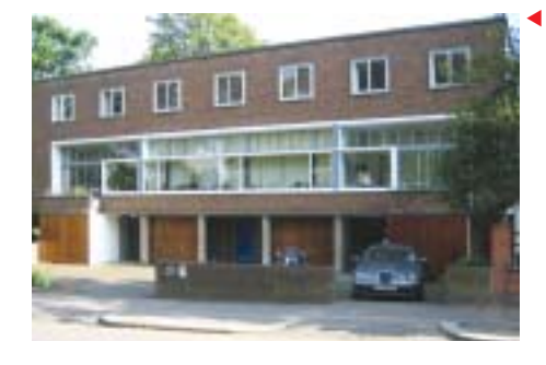
2 Willow Road Built as a family home in 1939, this important Modernist building (Grade II* listed) has been acquired by The National Trust and is now open to the public.

Now continue walking along Downshire Hill past the Freemason's Arms public house (of 1819) and cross Willow Road. (Or leave the route to see 2 Willow Road – Ernö Goldfinger's house stands just to your left).