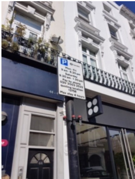
Test-tubes in England's Lane

Thank you to all the Belsize Society members and other volunteers who have helped to bring to a successful conclusion the community air quality monitoring study in Belsize Park / Swiss Cottage. We are now excitedly awaiting the results, hopefully due around the end of March 2020.