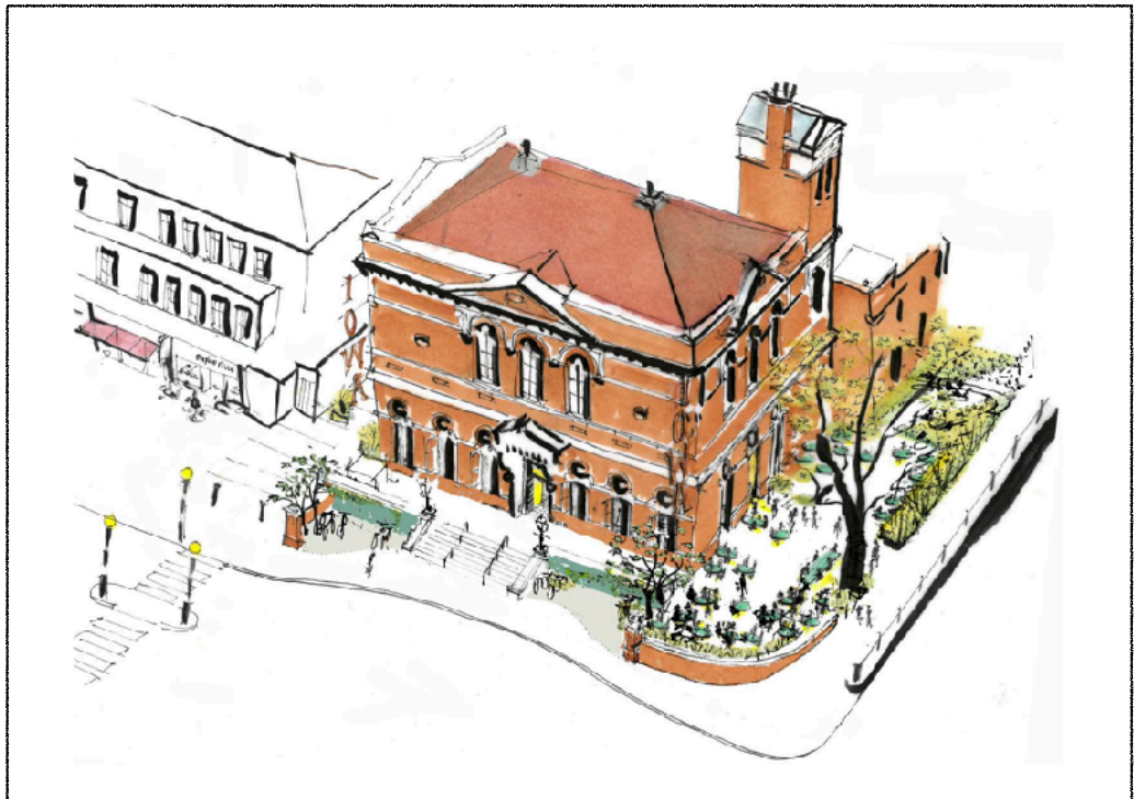
In March 2019 Wac Arts appointed Ash Sakula Architects to develop the "Inside Out Wac Arts" design.

weekends. Twenty years later and with a full weekend of activity for 5-26 year olds, it found itself to have outgrown the Inter-Action space and in 2000 secured the Old Town Hall, which was about to be turned into a commercial site, as its new home.